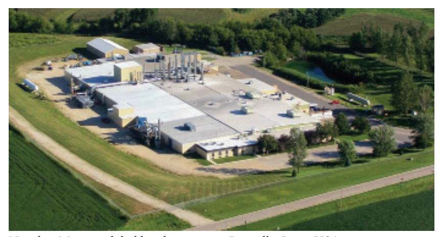
Norplex-Micarta global headquarters in Postville, Iowa, USA

Norplex-Micarta is the leading manufacturer of high performance thermoset composites. Norplex-Micarta's vast product line of tubing, sheet, pre-preg, and rod products serves power generation, military/aerospace, oil & gas, medical device, electrical device, electronics assembly, construction, heavy industry, and transportation industries throughout Asia/Pacific, Europe, and the Americas.